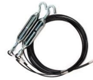
L) CORNER TENSION WIRE - 2