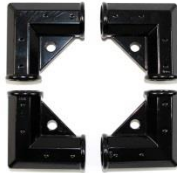
E) CORNER BRACES -4