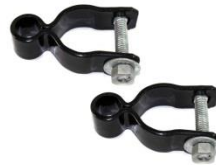
I) FEMALE HINGES -2