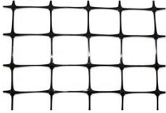
B) VERTICAL SIDES -2