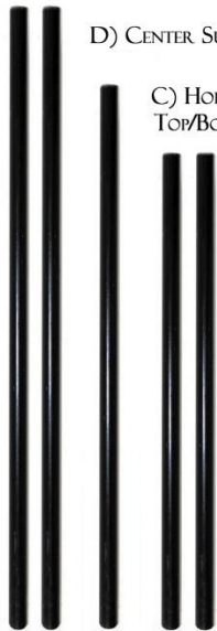
C) HORIZONTAL TOP/BOTTOM -2