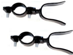
G) GATE LATCHES -2