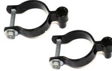
H) MALE HINGES -2