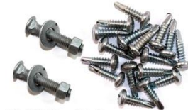
K) 5/16" x 2" CARRIAGE BOLT, NUT & WASHER -2 & SELF TAPPING SCREWS -16