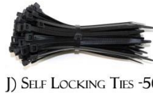
J) SELF LOCKING TIES -50